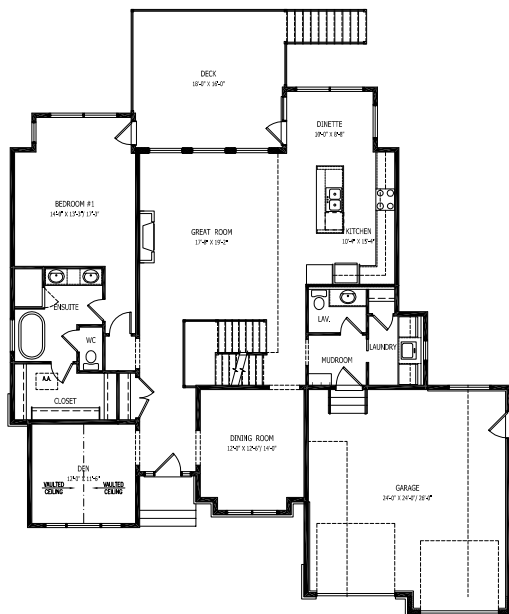
1 MAIN FLOOR PLAN - 1879 SQ FT 1/8" = 1'-0"